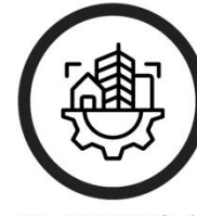
PLANNING & SUPPLY CHAINE